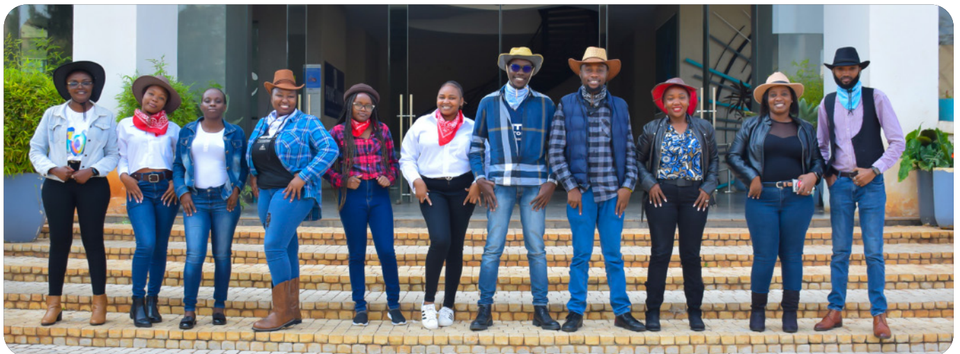
Username Staff celebrating quarterly Birthdays

We honoured cowboy day by dressing up like cowboys