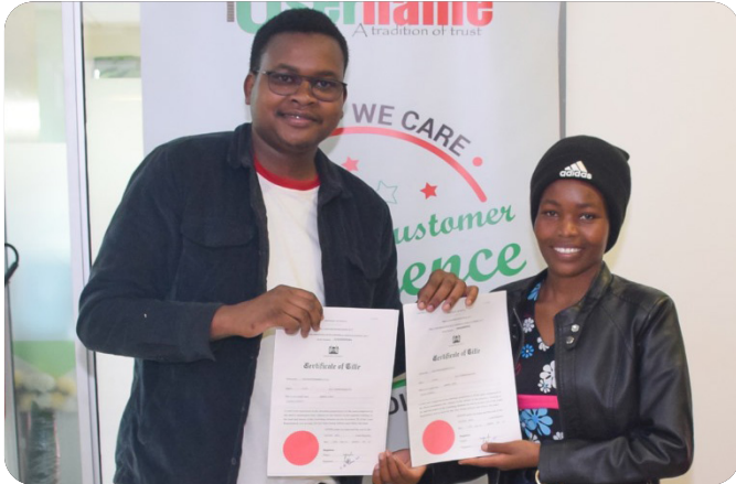
Username staff issuing Title Deeds